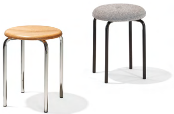
Stackable, up to 8 chairs