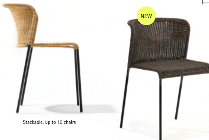
Stackable, up to 10 chairs